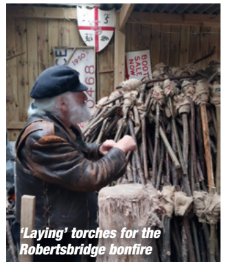
'Laying' torches for the Robertsbridge bonfire