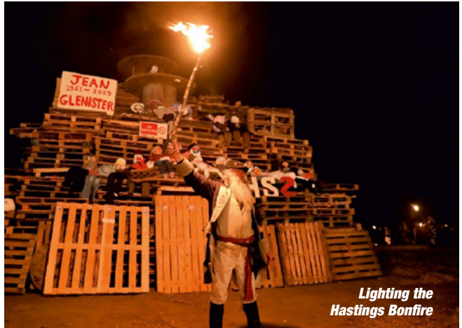
Lighting the Hastings Bonfire

He had a love of live music and was a regular at Hastings Old Town pub gigs and a great advocate for the Completely Scuppered Shanty crew, a member of which said: "We will all miss